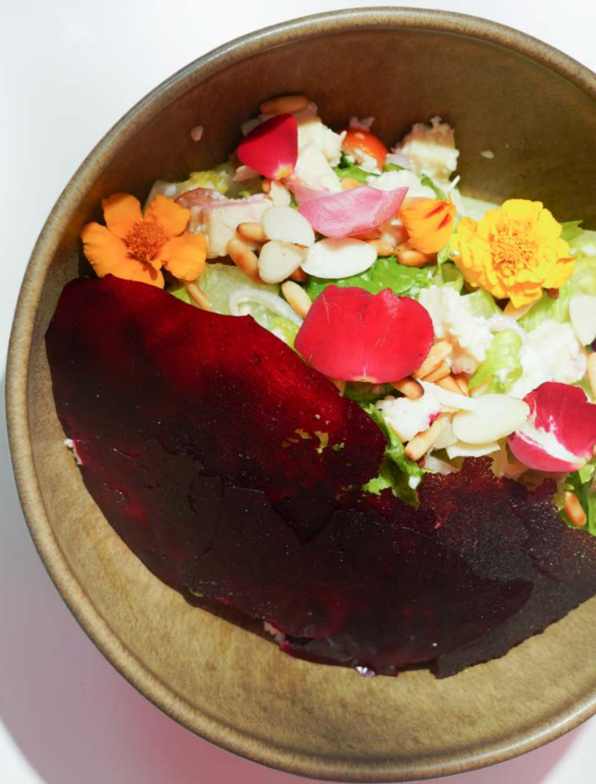
ABU DHABI ROMAINE, CHILLED CHICKEN BREAST, BEET "FATOUSH"