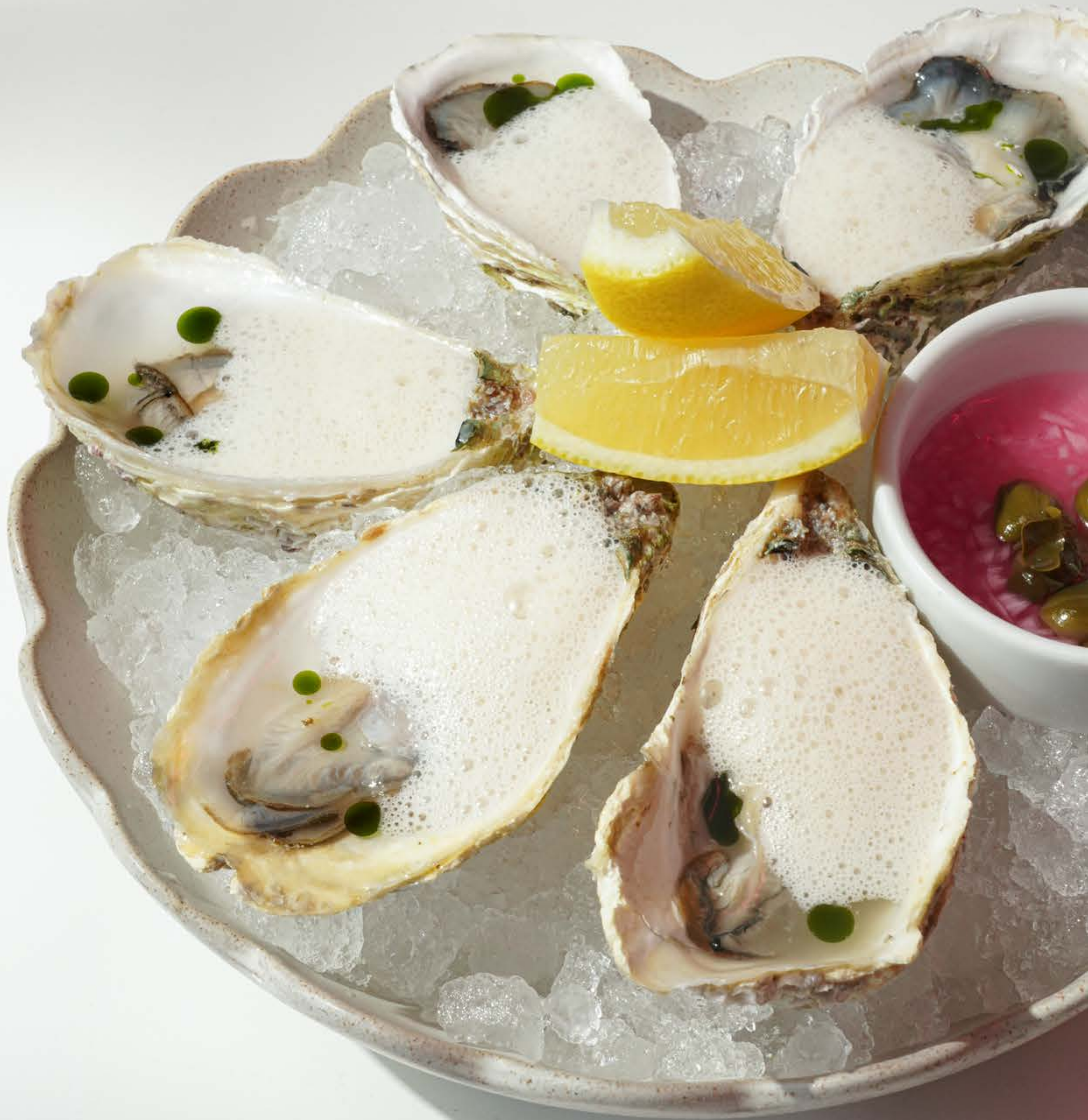
DIBBA BAY OYSTERS | 3PC. COCONUT MIGNONETTE