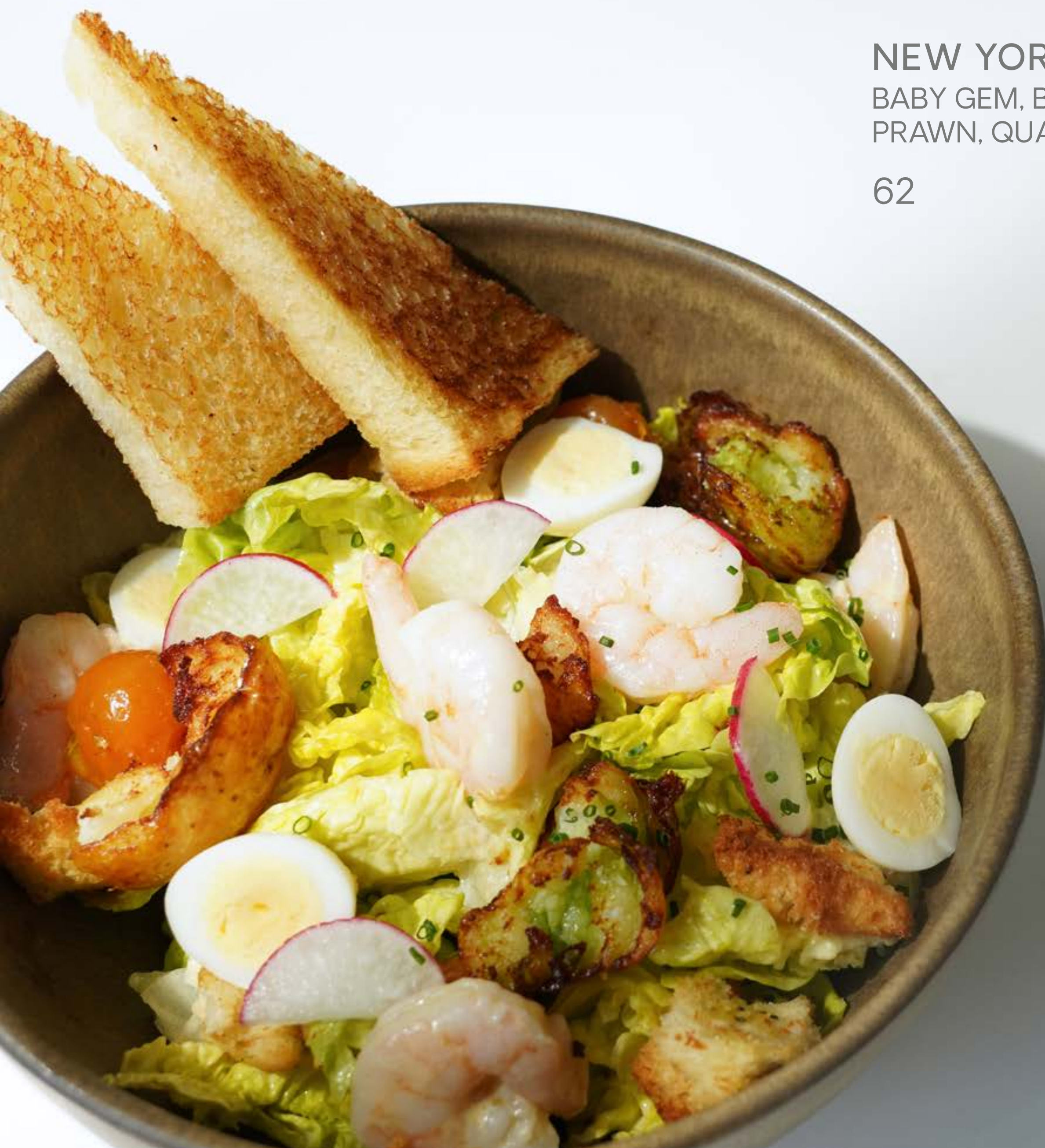
NEW YORK BABY GEM, BABY POTATO, TIGER PRAWN, QUAIL EGG, TOAST POINTS