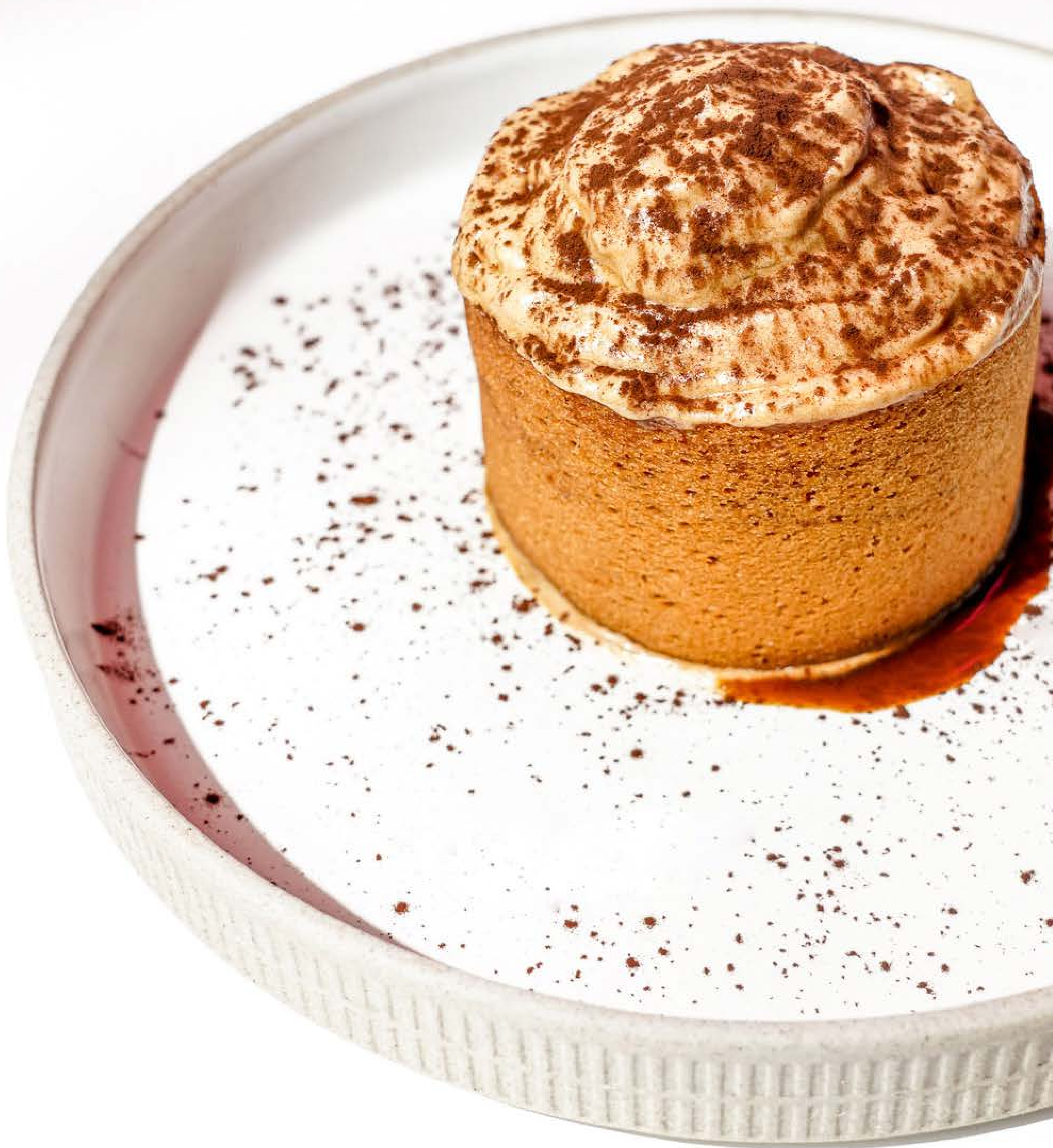
TIRAMISU LADYFINGER, TIRAMISU CRÉMEUX, VANILLA ICE CREAM, DOUBLE CHOCOLATE SAUCE